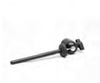
Photo Light Box Adapter for Dino-Lite Microscope cameras. The Dino-Lite Light Box Adapter allows for effortless integration of the Dino Lite digital microscope with many popular light box models (photo light box not included).